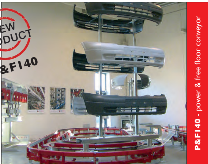
P&F140 - power & free floor conveyor