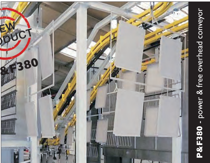
P&F380 - power & free overhead conveyor