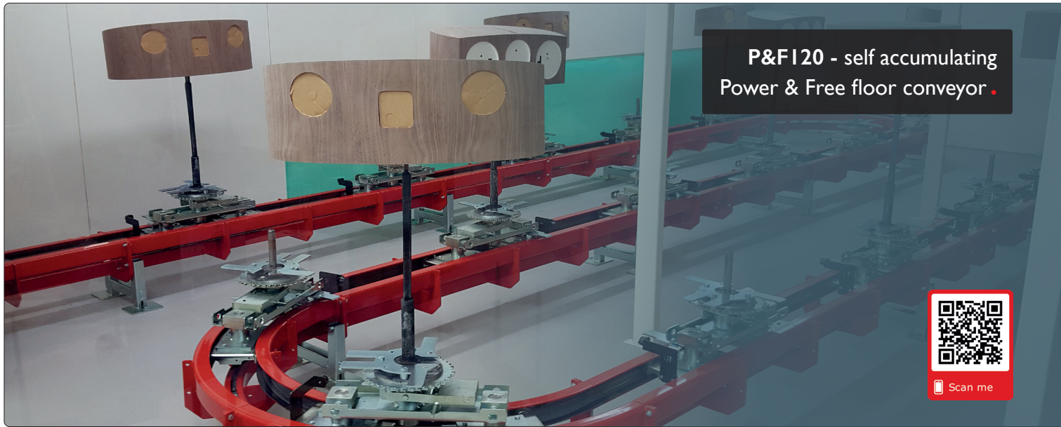
P&F120 - self accumulating Power & Free floor conveyor