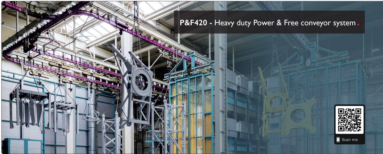
P&F420 - Heavy duty Power & Free conveyor system .

The flexible Power & Free conveyor system with a load capacity up to 22000 Lbs (10.000 kg).