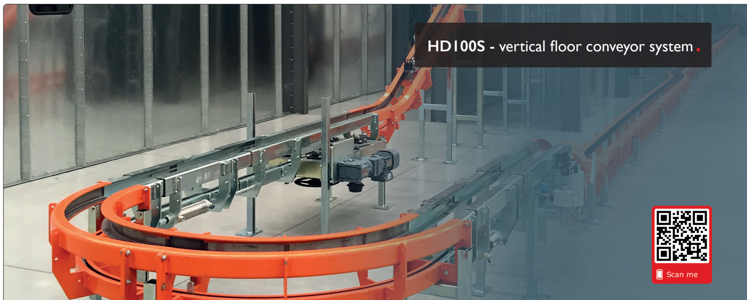
HD100S - vertical floor conveyor system .