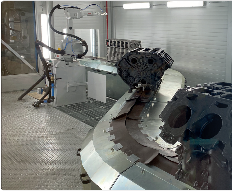
HDI40 - new Heavy Duty floor conveyor .