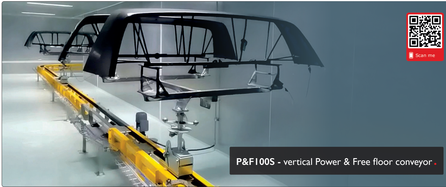
P&F100S - vertical Power & Free floor conveyor .